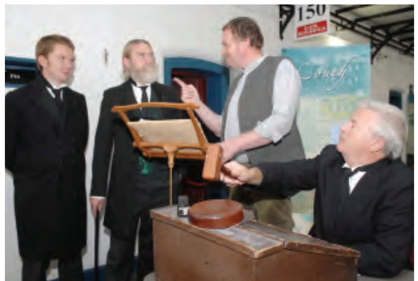
Actors who took part in an historical re-enactment at Louth County Archives Service.