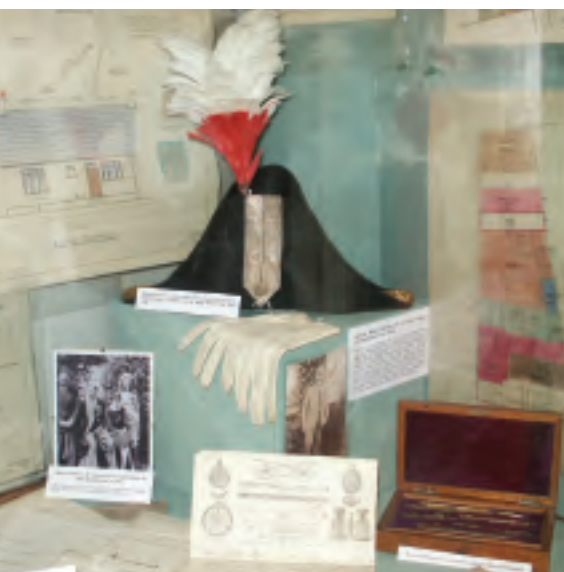
Part of the Reside collection at Newry Museum.