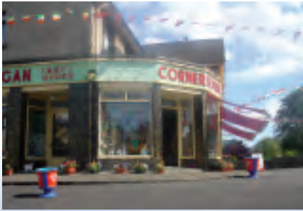
Omeath, Co. Louth.

This project involved initial technical assistance to enable the four coastal villages of Omeath, Dunfanaghy, Glenarm and Strangford to explore the potential for cross border collaboration in the area of business, tourism and economic development.