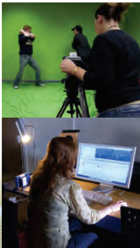
Green screen and editing facilities at The Bright Room provide skills training and development resources for the New Media Factory.