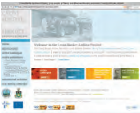
Website of the Cross Border Archive Project.

An education resource was also produced for 250 schools in the Louth-Newry & Mourne regions, this CD ROM uses material in both archives to look at the themes that are studied by schools such as the Great Famine, the Home Rule Crisis and Partition and provides a local perspective on these national events.